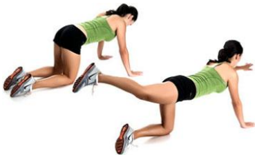
4. Pointer (back / glutes)