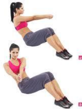
5. Russian Twist (core)