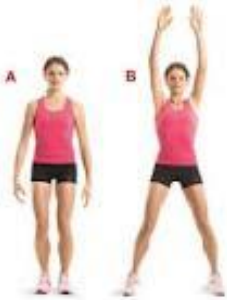
1. Jacks (warmup)