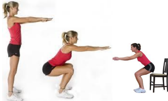
2. Squats (legs / glutes)