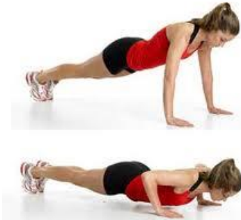
3. Pushups (chest/arms/shoulders/core)