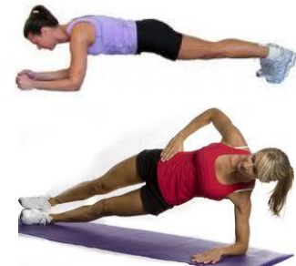
6. Planks (core)